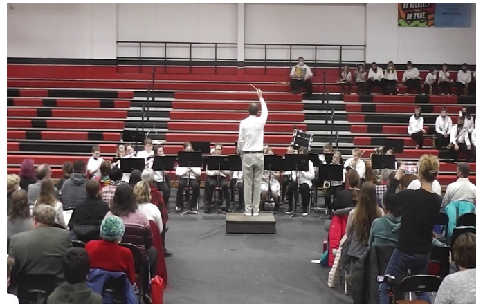
5-12 Band Concert Apr 19 to follow the Choir Concert (approximately 7:00 pm)