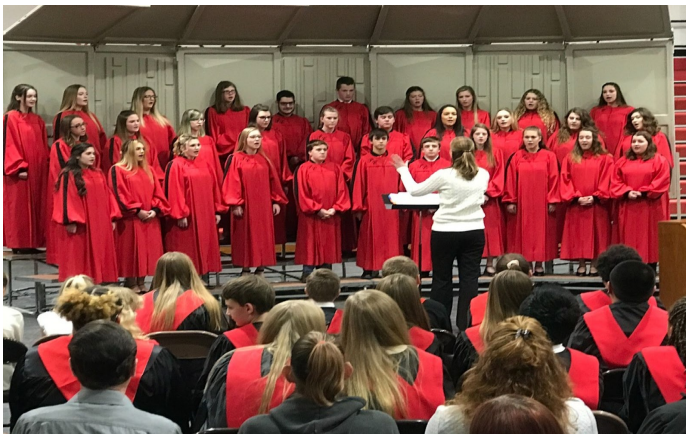
5-12 Choir Concert April 19 at 6:00 pm